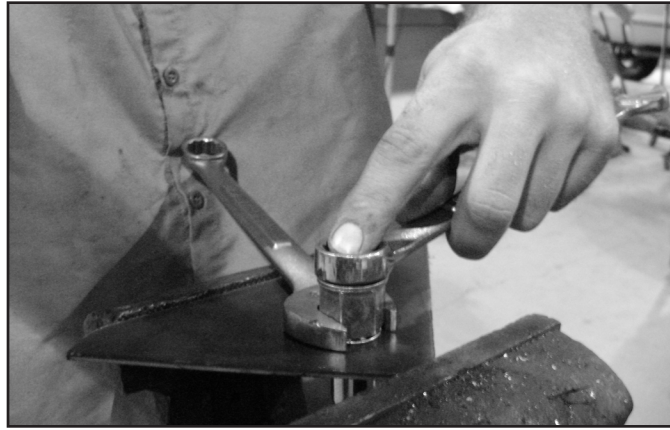
FIGURE 4 - 1/2" RIVET NUT INSTRUCTIONS