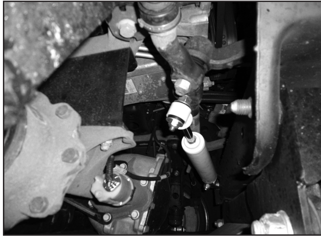
FIGURE 2 - PASS SIDE STABILIZER MOUNT