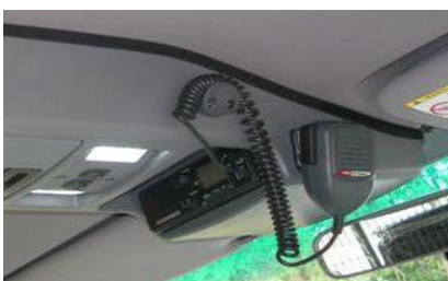
Microphone clip on slight angle

Install in a position that suits best, depending on vehicle and Radio model. Ensure microphone or microphone cable and holder does not foul on sun visor when pulled down.