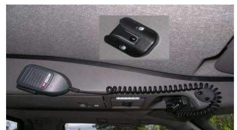
Microphone clip on acute angle