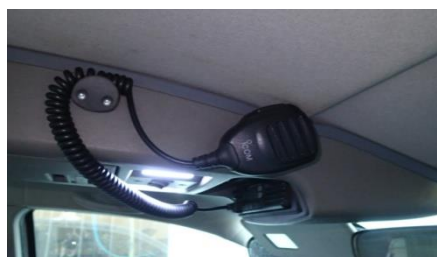
Left hand cable outlet radios