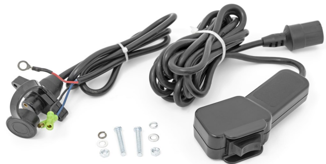
Rough Country Winch Wired Winch Controller