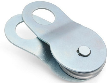
Part # RS125-Snatch Block