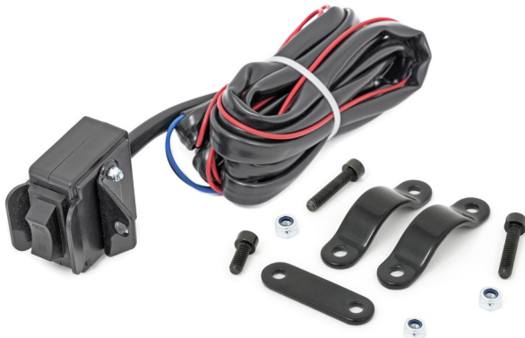
Rough Country Handle Bar Switch