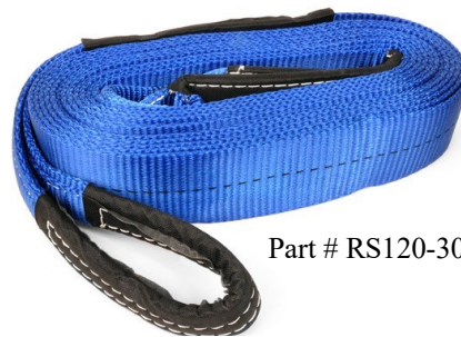
Part # RS120-30M Winch Strap