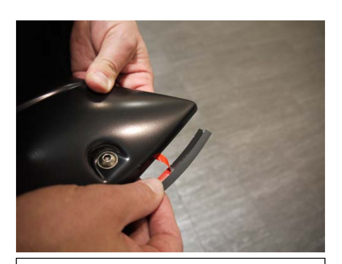
STEP 10: Attach the included rubber seal to the Fender Flares. Peel back 2" of the adhesive backing and position on the Fender Flare. Attach the seal to the Fender Flare, peeling back a few inches at a time. Attach rubber seal along all areas the Fender Flare will make contact with the vehicle body. Trim any excess rubber seal