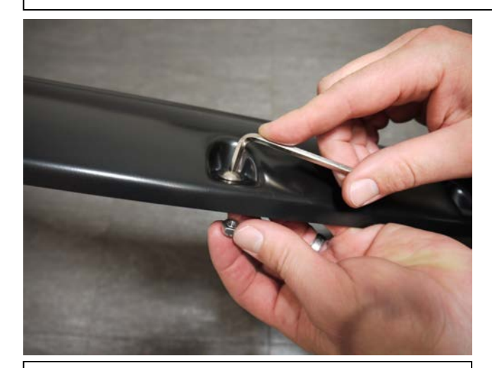
STEP 1: Attach 9 bolts to each Fender Flare using a 3/16" Allen key and a 10.0mm wrench/socket. (wrench/socket and Allen key not supplied). Ensure inside of Fender Flares where the rubber seal is attached is clean, using the alcohol wipes provided. Wipe away any residue with a dry clean cloth.

PAINTING INSTRUCTIONS – If Fender Flares are being painted; do not install edge extrusion until painting is complete. Prior to painting, clean all surfaces to be painted using clean water and a mild detergent, do not use lacquer thinner or any solvent based products. Wipe completely dry. Best results will be achieved by wiping the areas to be painted with a tack rag just prior to painting. Most automotive paints can be applied directly to the Fender Flares, however some may require a primer (check paint manufacturer specifications). Good adhesion will be achieved without sanding. Select a paint (and primer if necessary) that is suitable for rigid plastics PMMA (Acrylic). If using a paint system that requires baking, do not expose the product to temperatures above 70°C (158°F). Do not fit the extrusion or any of the hardware to the Fender Flares until the paint is completely dry.