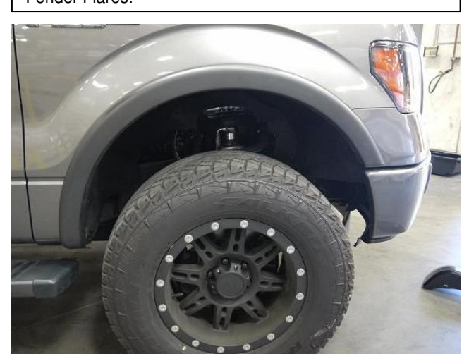
STEP 5: Clean the body areas where the Fender Flares will makes contact..