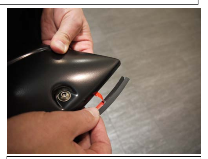
STEP 2: Attach the included rubber seal to the Fender Flares. Peel back 2" of the adhesive backing and position on the Fender Flare. Attach the seal to the Fender Flare, peeling back a few inches at a time. Attach rubber seal along all areas the Fender Flare will make contact with the vehicle body.