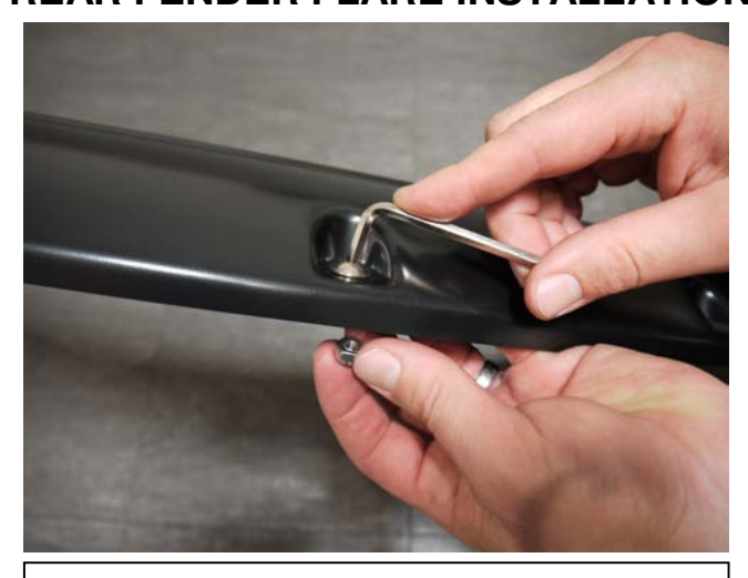
STEP 9: Attach 10 bolts to each Fender Flare using a 3/16" Allen key and a 10.0mm wrench/socket. (wrench/socket and Allen key not supplied). Ensure inside of Fender Flares where the rubber seal is attached is clean, using the alcohol wipes provided. Wipe away any residue with a dry clean cloth.