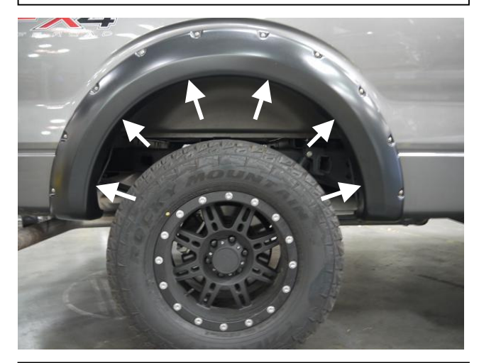
STEP 12: Place the Fender Flare onto the vehicle and fit into the correct position following the contours of the body. Use twelve (12) of the .6mm clips (six (6) per side) to secure the Fender Flare to the body. Make sure the dimple in the clip securely attaches in the slot on the Fender Flare.

For models equipped with factory fender flares, removal of factory flares is required, please consult the vehicle service manual for factory fender flare removal.