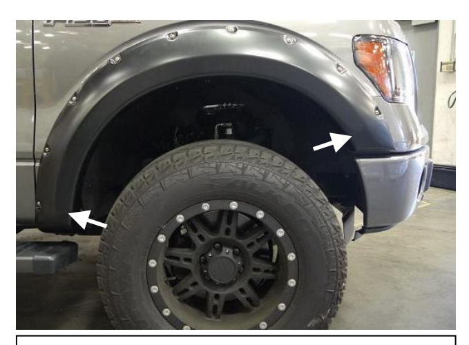
STEP 7: Place the Fender Flare onto the vehicle and fit into the correct position following the contours of the body. Use four (4) of the .6mm clips (two (2) per side) to secure the Fender Flare to the body. Make sure the dimple in the clip securely attaches in the slot on the Fender Flare.

Bolt-On/Rugged Fender Flares Ford F150 (04-14) FIT-FF755