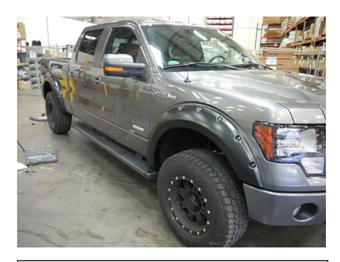
STEP 13: Double check the front and rear Fender Flares to make sure all bolts are tight and clips are securely fastened. Your installation is now complete. Do not use abrasive cleaners.