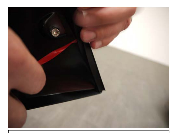
STEP 3: Pulling at right angles to the extrusion, remove the liner from the extrusion in small portions and apply thumb pressure to ensure that it adheres to the Fender Flares.

Bolt-On/Rugged Fender Flares Ford F150 (04-14) FIT-FF755