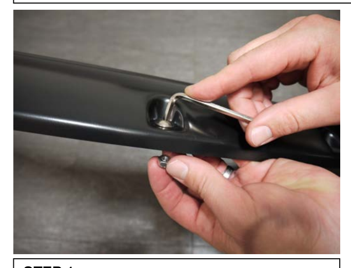
STEP 1: Attach supplied bolts and nuts to each Fender Flare using a 3/16" Allen key and a 10.0mm socket. (wrench/socket and Allen key not supplied) Ensure inside of Fender Flares where the rubber seal is attached is clean, using the alcohol wipes provided. Wipe away any residue with a dry clean cloth.

PAINTING INSTRUCTIONS – If Fender Flares are being painted; do not install edge extrusion until painting is complete. Prior to painting, clean all surfaces to be painted using clean water and a mild detergent, do not use lacquer thinner or any solvent based products. Wipe completely dry. Best results will be achieved by wiping the areas to be painted with a tack rag just prior to painting. Most automotive paints can be applied directly to the Fender Flares, however some may require a primer (check paint manufacturer specifications). Good adhesion will be achieved without sanding. Select a paint (and primer if necessary) that is suitable for rigid plastics PMMA (Acrylic). If using a paint system that requires baking, do not expose the product to temperatures above 70°C (158°F). Do not fit the extrusion or any of the hardware to the Fender Flares until the paint is completely dry.