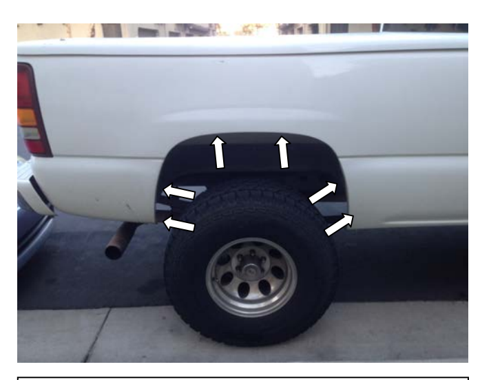
STEP 13: Install the supplied screw plugs into the existing holes in wheel arch as show.

For GMC models equipped with factory bodyside moldings, note the molded line on the insie edge of the Fender Flare corresponding to the body side molding. Trm the fender flare to this line prior to installing, this is only necessary for GMC Yukon XL models.