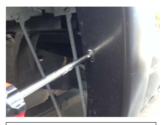
STEP 7: Place the Fender Flare onto the vehicle and fit into the correct position following the contours of the body. Locate the mounting slots in the part over the installed screw plugs. Install screws through the screw plugs as shown. Repeat installation method for other side. Double check the front Fender Flares to make sure all screws are tight securely fastened.