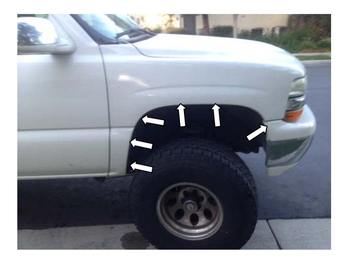
STEP 6: Install the supplied screw plugs into the existing holes in wheel arch as show.