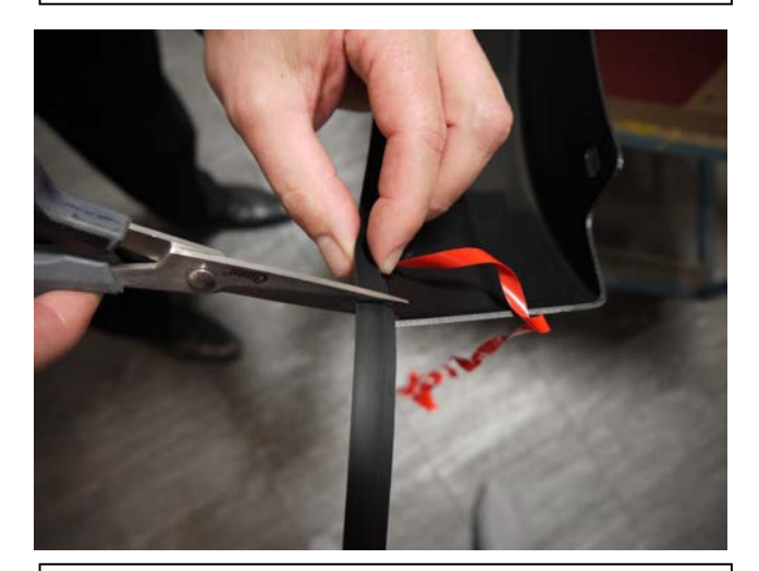
STEP 11: Trim any unnecessary extrusion and discard.