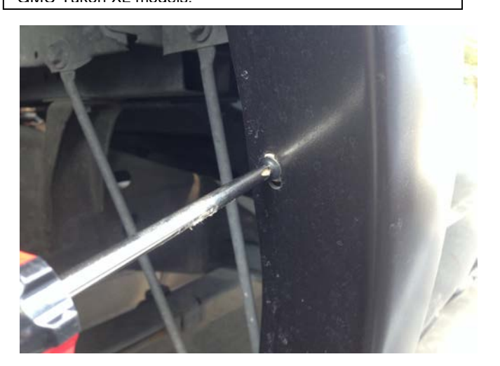
STEP 14: Place the Fender Flare onto the vehicle and fit into the correct position following the contours of the body. Locate the mounting slots in the part over the installed screw plugs. Install screws through the screw plugs as shown. Repeat installation method for other side. Double check the rear Fender Flares to make sure all screws are tight securely fastened.