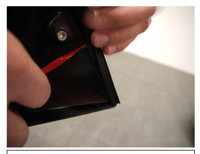
STEP 3: Pulling at right angles to the extrusion, remove the liner from the extrusion in small portions and apply thumb pressure to ensure that it adheres to the Fender Flares.

Bolt-On/Rugged Fender Flares Chevy Silverado (99-07) FIT-FF745