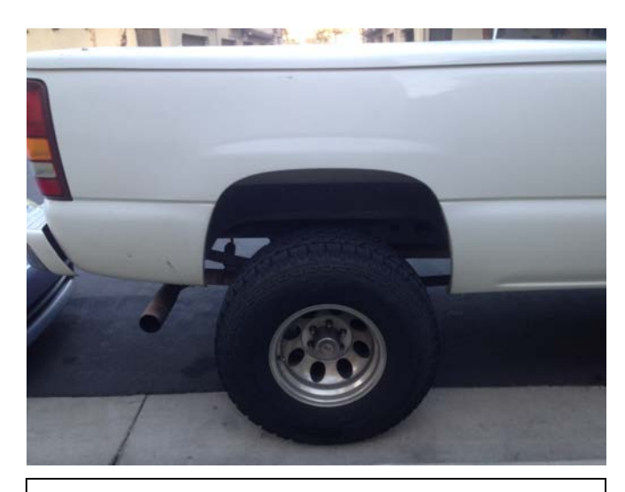
STEP 12: Clean the body areas where the Fender Flares will make contact with a clean cloth.

Bolt-On/Rugged Fender Flares Chevy Silverado (99-07) FIT-FF745