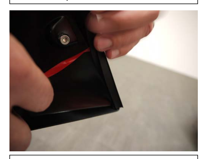
STEP 10: Pulling at right angles to the extrusion, remove the liner from the extrusion in small portions and apply thumb pressure to ensure that it adheres to the Fender Flares.