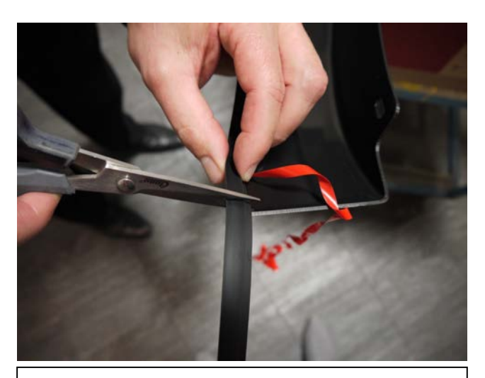
STEP 4: Trim any unnecessary extrusion and discard.