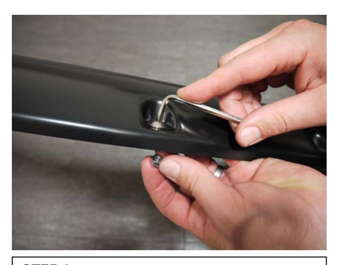
STEP 8: Attach supplied bolts and nuts to each Fender Flare using a 3/16" Allen key and a 10.0mm. (wrench/socket and Allen key not supplied) Ensure inside of Fender Flares where the rubber seal is attached is clean, using the alcohol wipes provided. Wipe away any residue with a dry clean cloth.