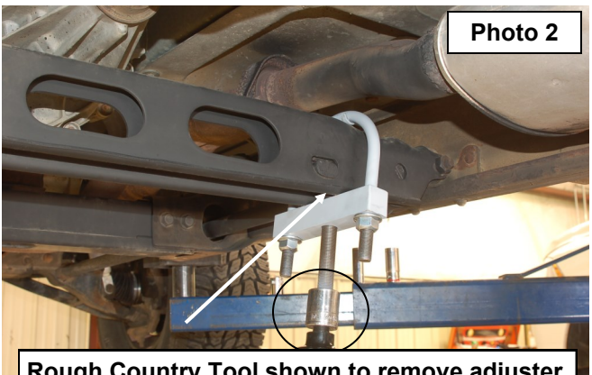
Rough Country Tool shown to remove adjuster