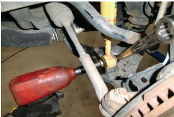
Remove lower strut mounting hardware