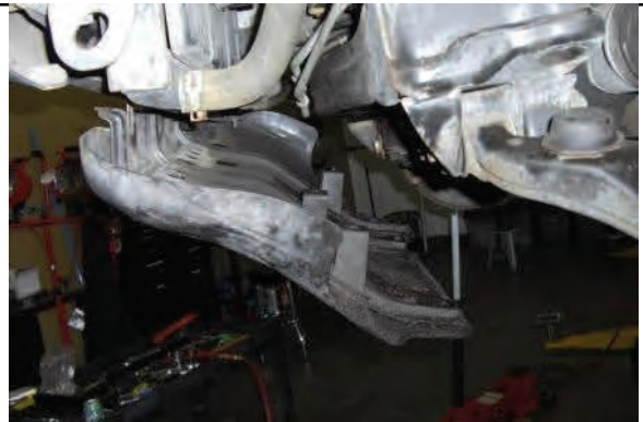
4WD models remove front skid plate