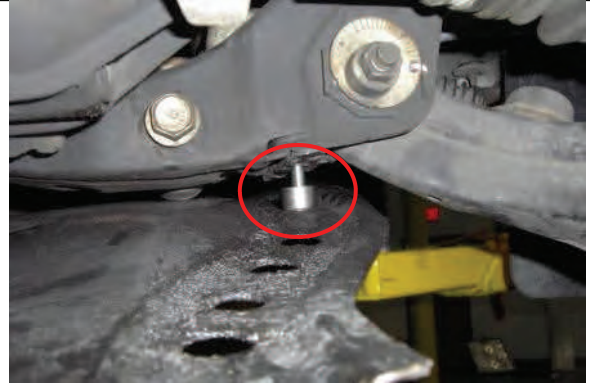
4WD Reattach skid plate with provided spacers and hardware

Reinstall lower strut mounting hardware and torque. Raise suspension and reconnect upper ball joint and tighten, replacing the retaining clip, the reattach both ABS/brake line brackets. Sway bar end links can be done simultaneously once both sides are complete. Recheck all work and check for tire clearance between the upper control arm.