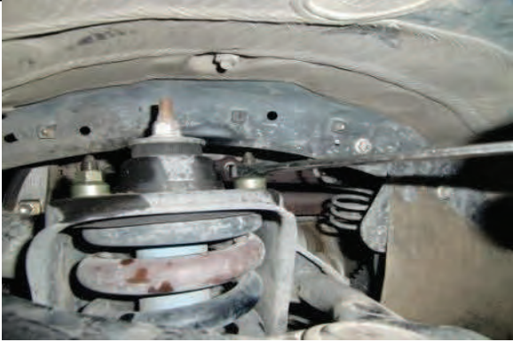
Remove upper strut mounting hardware