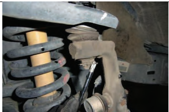
Remove upper ball joint retaining clip