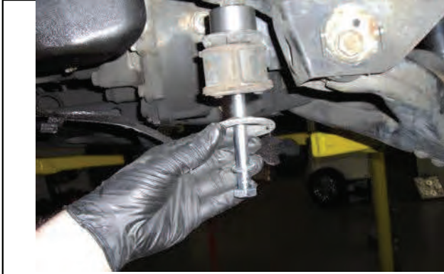
4WD Install longer bolts and reattach differential to frame