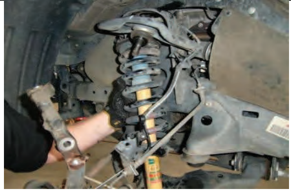
Remove strut assembly from vehicle