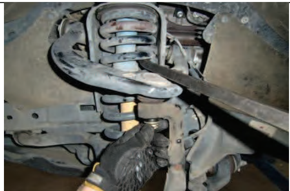
Support suspension and remove upper ball joint nut