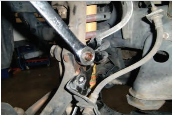
Disconnect sway bar end link at spindle