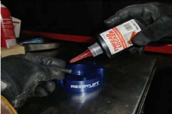
T6 Only Assemble billet spacer with thread locker