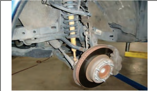
Raise and support vehicle on frame