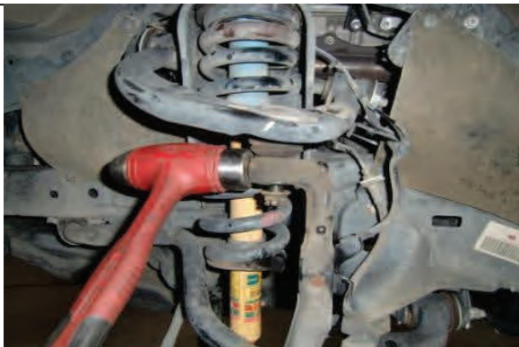
Loosen upper ball joint nut and strike to disconnect