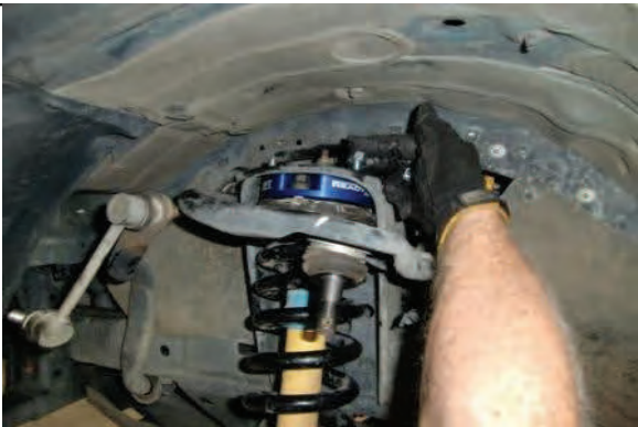
Reinstall in vehicle and attach with provided hardware.