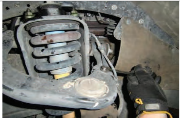
Disconnect ABS/brake line upper bracket