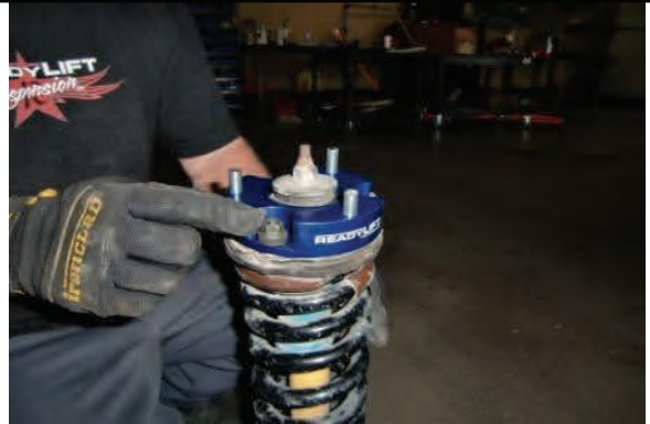
Attach assembled spacer to top of strut w/ OE hardware