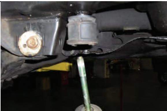
4WD Support differential & remove front mounting hardware