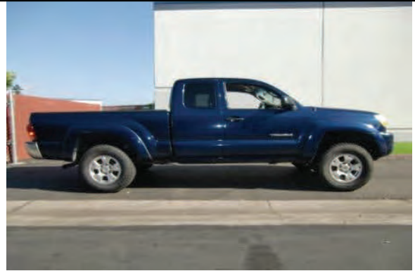
Install wheels/tires, torque, test drive and align

Reinstall lower strut mounting hardware and torque. Raise suspension and reconnect upper ball joint and tighten, replacing the retaining clip, the reattach both ABS/brake line brackets. Sway bar end links can be done simultaneously once both sides are complete. Recheck all work and check for tire clearance between the upper control arm.