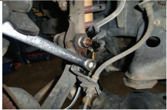
Disconnect ABS/brake line bracket at spindle