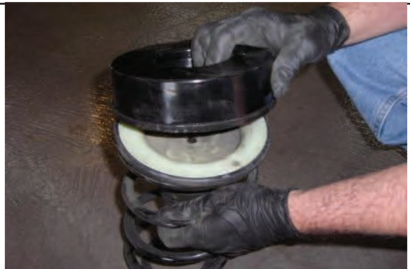
Place coil spacer on top of bump stop on coil spring