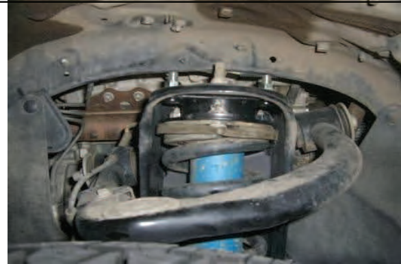
Rotate strut 180 degrees & reinstall with provided hardware