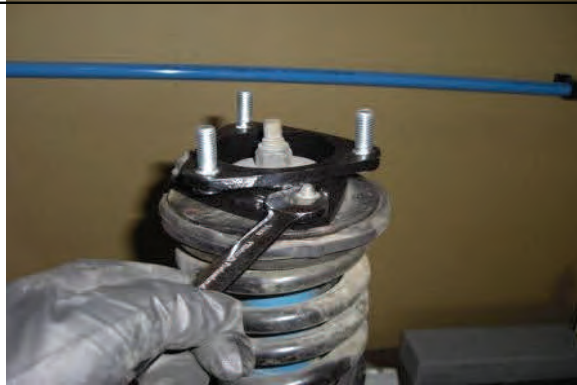
Attach assembled spacer to top of strut w/ OE hardware