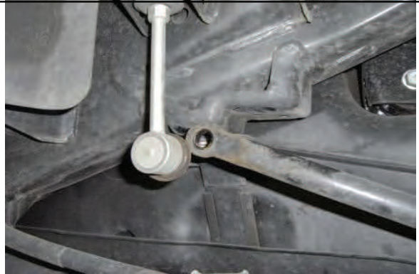
Disconnect lower sway bar endlinks