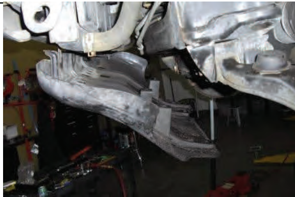
4WD models remove front skid plate