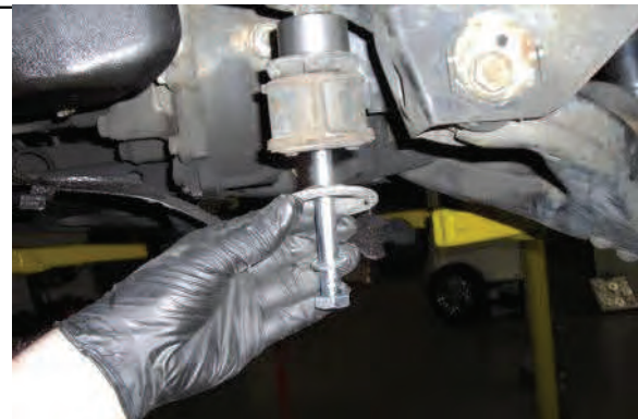
4WD Install longer bolts and reattach differential to frame