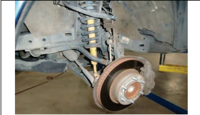
Raise and support vehicle on frame