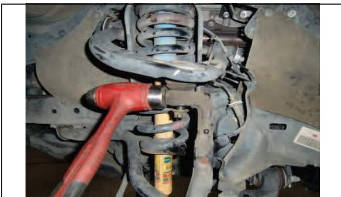
Loosen upper ball joint nut and strike to disconnect