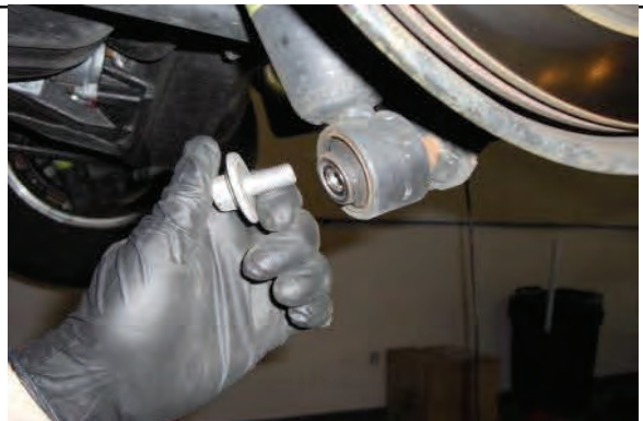
Reconnect and tighten lower shock and sway bar endlinks