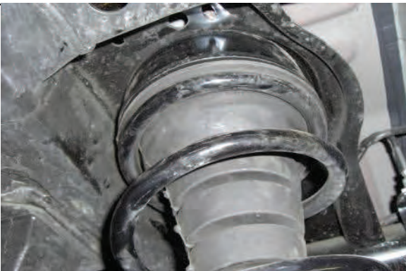
Reinstall into vehicle and raise axle