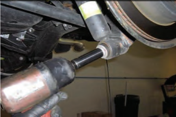
Support rear axle and disconnect lower shock mount.

Rear Installation: Take caution during installation to ABS/brake lines .