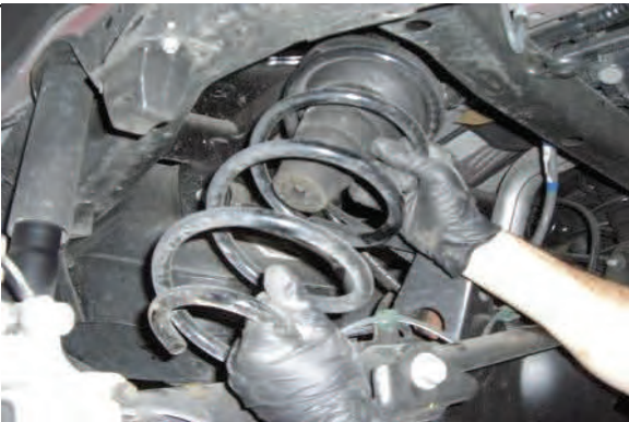
Carefully lower axle enough to remove coil spring