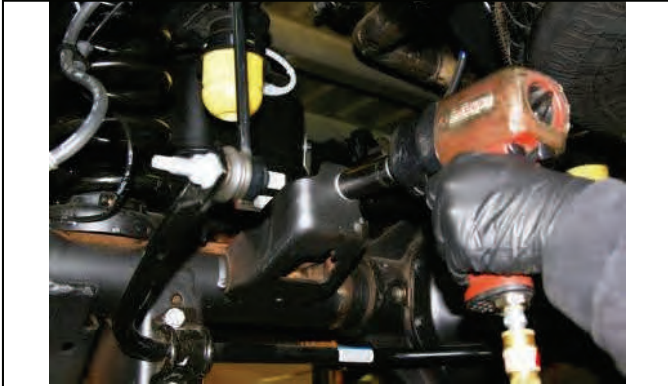
Support rear suspension and remove rear trac bar bolt