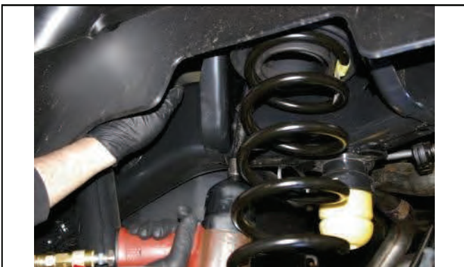
Reinstall OE isolator and coil spring, raise suspension.