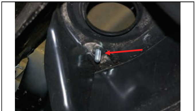
Use provided hardware to fasten new spacer and tighten.