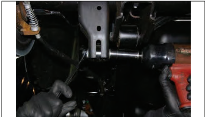
Remove lower shock mounting hardware.