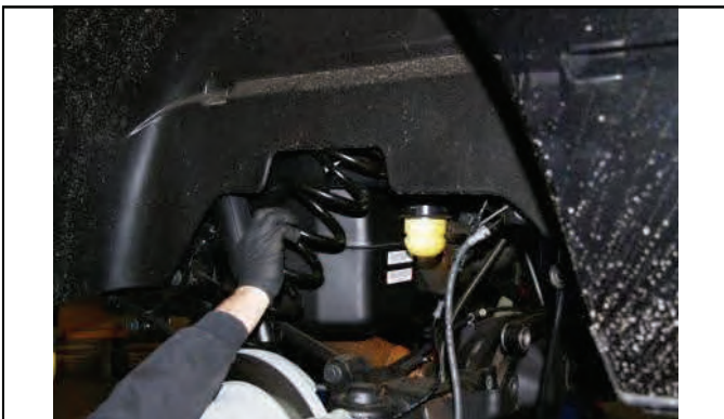
Carefully lower axle, remove spring and upper rubber isolator