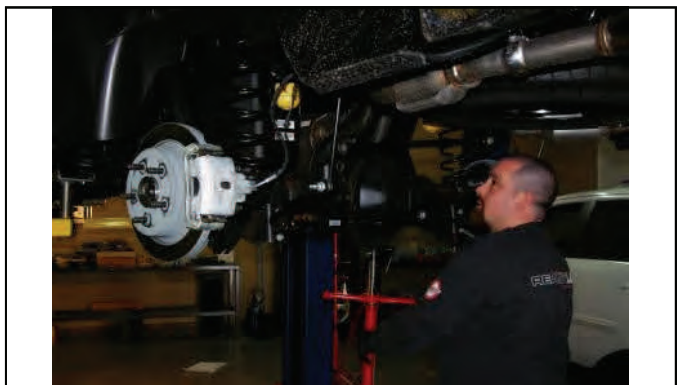
Reattach shocks, trac bar, sway bar end links, and ABS lines