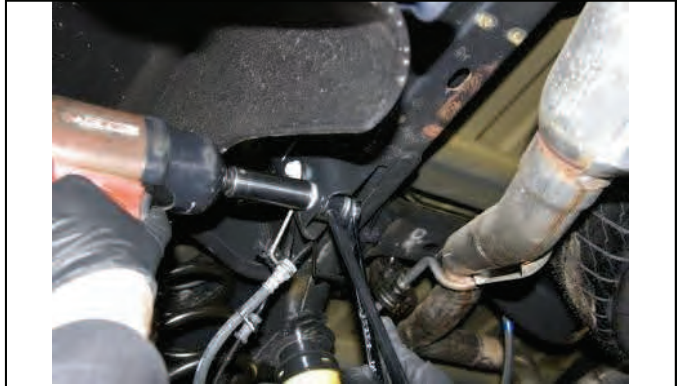
Disconnect upper sway bar end links.