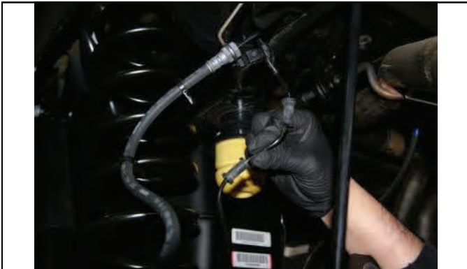
Disconnect ABS lines to avoid damage during installation.