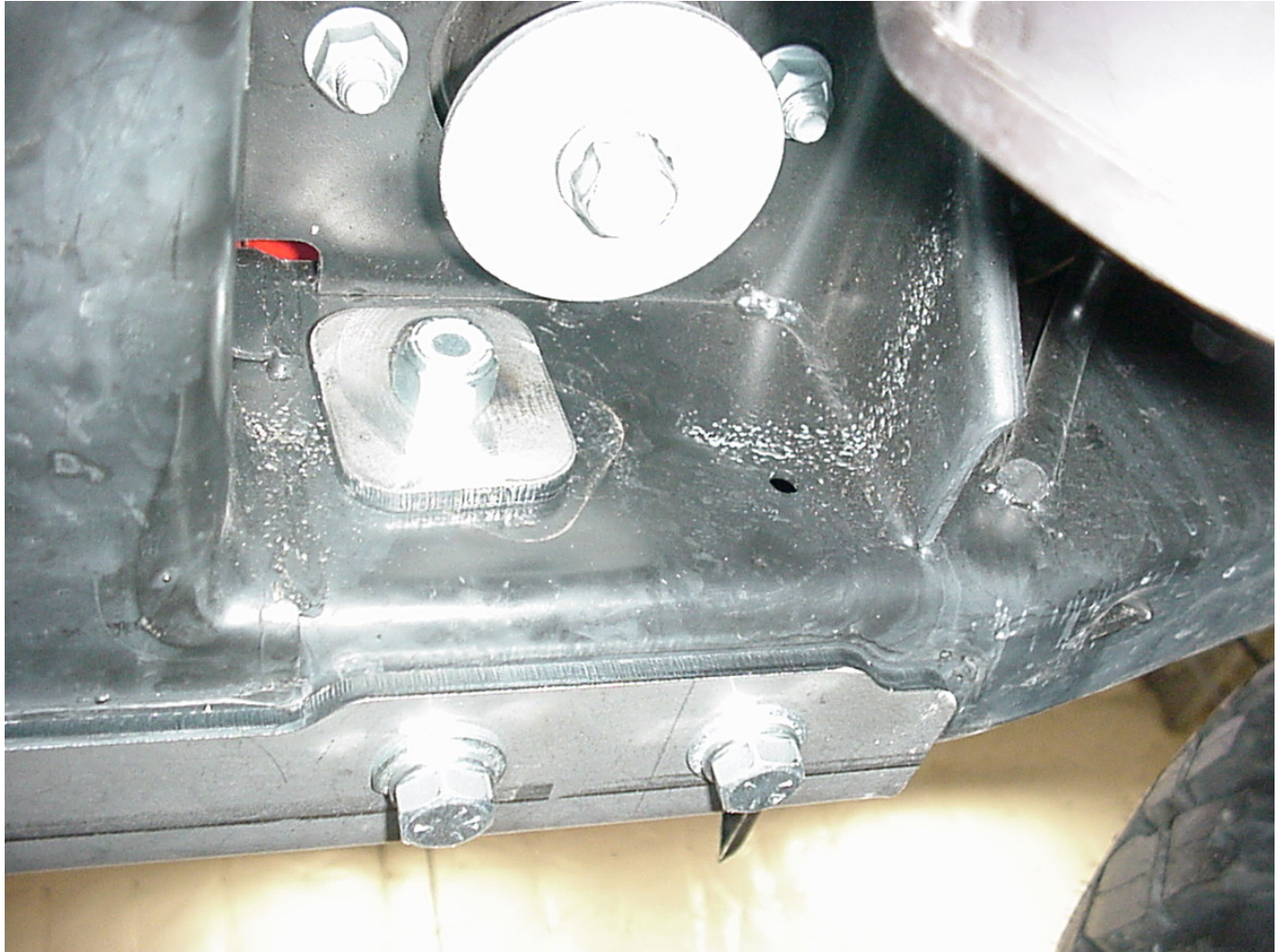
Figure 1: Driver's Side view of Frame Crush Tube Installed.

Insert the frame crush tubes into the frame from the inside of the frame rail. See Figure 1 .