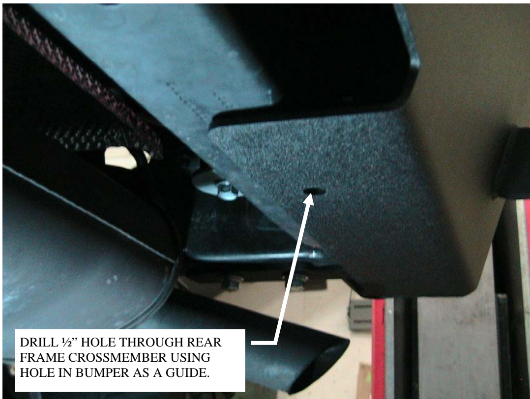
Figure 4: Drill two 1/2" holes into frame crossmember.

Some vehicles have holes already in the rear crossmember and may not require drilling on one side or both.